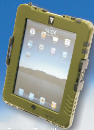
Case for iPad with Quicksnapper front view